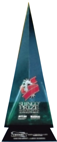
■ Shingo Prize for Excellence in Manufacturing